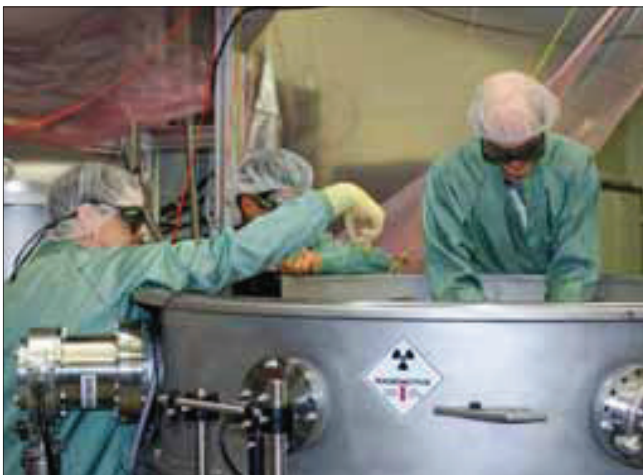
Researchers inserting a target assembly into the PHELIX laser beamline at the GSI lab in Darmstadt. Earlier this year, the LIGHT team connected the laser-ion-acceleration target chamber to an existing ion-accelerator beamline at the lab.

to create an exciting new state called warm, dense matter. A case in point: we recently published results in Physical Review Letters demonstrating the transformation of carbon into the liquid state using a laser-driven ion beam. The high peak current and ultrashort pulse duration (1 ps) of the ion beam enable us to heat carbon to about 5000 K and observe the transformation of the lattice into a kind of liquid.